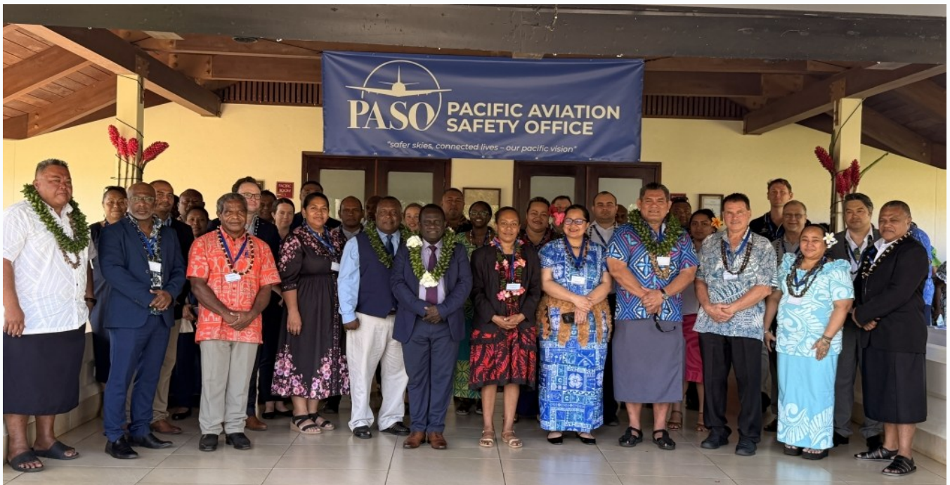
Photo credit: Pacific Aviation Safety Council Meeting 2025 - Pacific Aviation Safety Office

CASA PNG obliged by sending its Inspectors to these PSIDS and have received numerous accolades from the Director Generals of these PSIDS for its audit reports and recommendations which has added value to regional aviation safety.