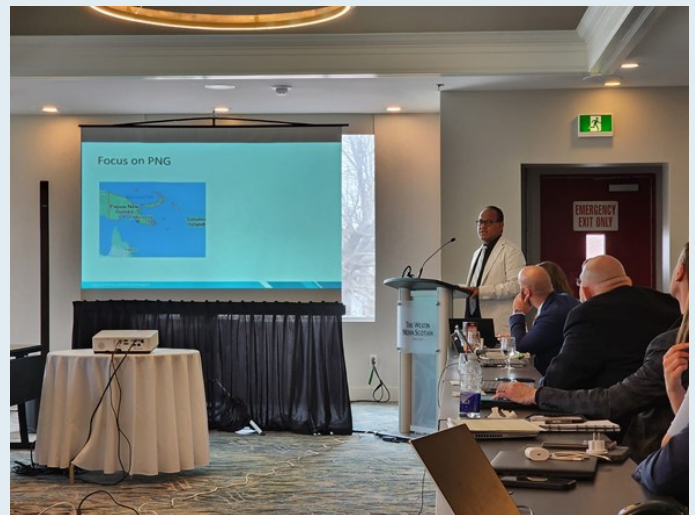
CASA PNG Executive Manager Safety Regulation Division presenting at SM ICG in-person meeting in Nova Scotia, Halifax Canada from 17-21 March 2025.

CASA PNG benefits from collaborating and sharing of lessons learned and best practices. This collaboration helps PNG avoid duplication of efforts and enable them to better share information and provide oversight of multi-national organizations. Aviation Industry organizations also greatly benefit SMS requirement harmonization among regulators since many companies own multiple certificate types in multiple nations. Additionally, sharing methods and tools assists in developing effective and efficient Safety Management Systems.