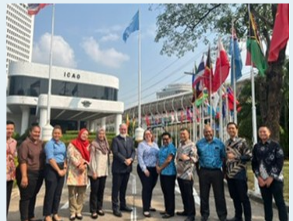
Article and photo by attending CASA team.

enhancing the Safety Management Systems (SMS), State Safety Program (SSP), and National Aviation Safety Plan (NASP). It featured a collaborative sharing of experiences from each State, with a focus on safety performance monitoring and the lessons learned along the way. The session addressed four key areas drawn from Australia's journey in developing their SSP and their second NASP.