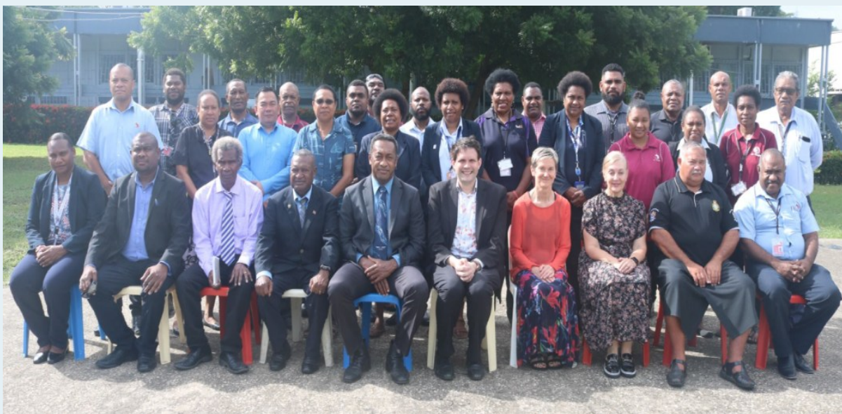
Group photo taken during the training with the course facilitators.

The two ICAO Trainings conducted over 3 weeks consecutively had trained 40 Aviation security personnel in Air Cargo and Mail security and Aviation Security Supervisors respectively.