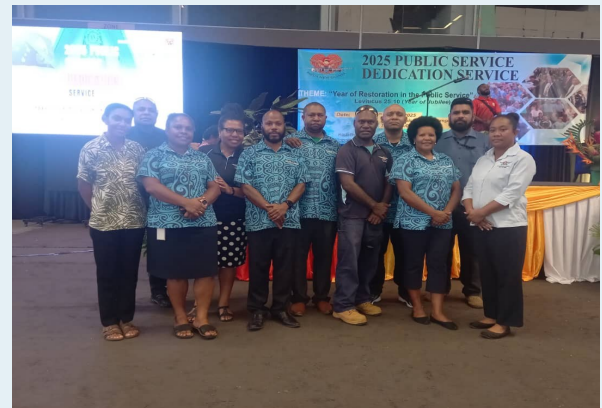
Some of the CASA PNG staff that attended the dedication service

The Keynote Speaker Prime Minister Hon. James Marape, also emphasized on the theme, urging public servants to reflect on their roles and commit to restoring PNG as a nation. This was followed by the launching and dedication of all GoPNG 2025 Annual Operational Plans and Dedication Prayers and concluded with the recital of the Public Service Oath led by a Judge from the National and Supreme court.