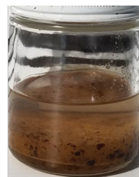
Figure 1- Pictures of Aviation fuel contaminated with dissolved water, dispersed and free water